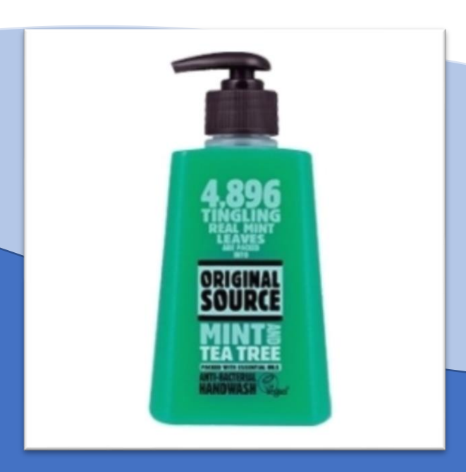
Time to use that soap you love