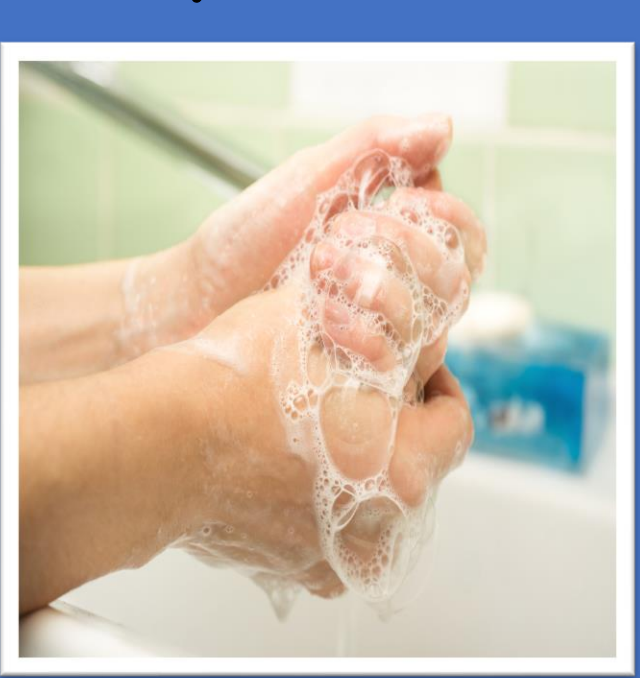
Work up a lather while counting to 20