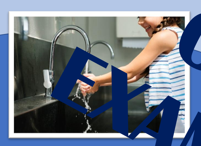
Wet your hands just like h. a