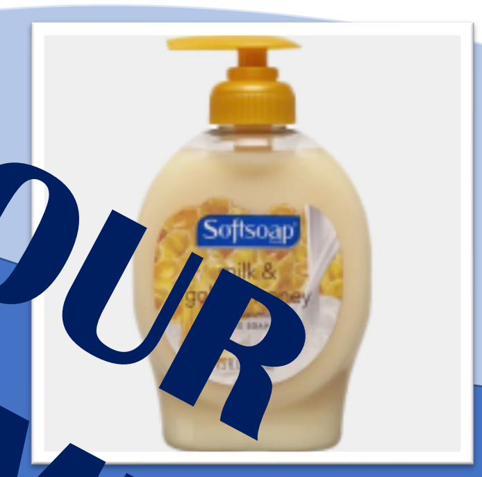
e e of your favourite soap